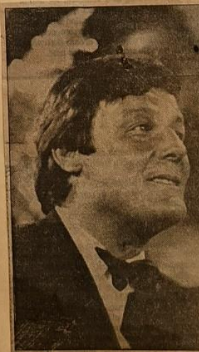
Peter Duchin will serenade the 1984 Debutantes.

Decorations: Lots of flowers are neat, but I'm not wild about plants. It's just a personal thing with me. I am a man who loves to garden in the country. I hate to see them in the city. But I love lots of flowers.